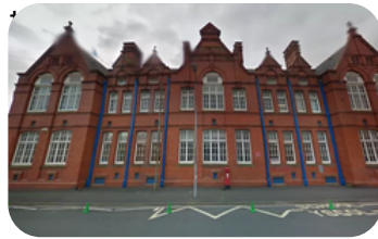
Roath Park Primary school's main building

This school has its very own Casper, the Green Lady. This lovable being has become a staple to the school and is not there to scare. There is much speculation about the origin of the Green Lady, theories fly from a caretaker to a dinner lady and, sadly, a