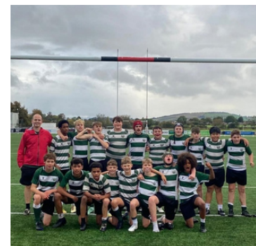
Year 9 Boys Rugby: District champions

Overall it's been an amazing month for Chosen Hill and we cannot wait to see what they do in November!