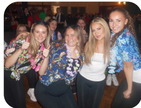
Getting ready for Carnival!

The day officially started with Carne. Their theme was 'carnival' and they did it justice. Their whole house choir song was the "Greatest Show" from the blockbuster