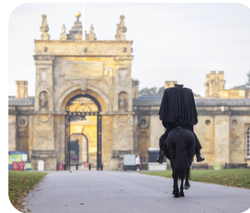
St John's College - Oxford University.

friendly ghost is well invested in the school. The Green Lady is loved by the parents, staff and pupils alike and it never