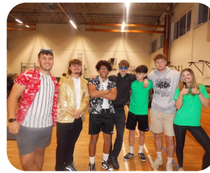
Six Form ready for the show!