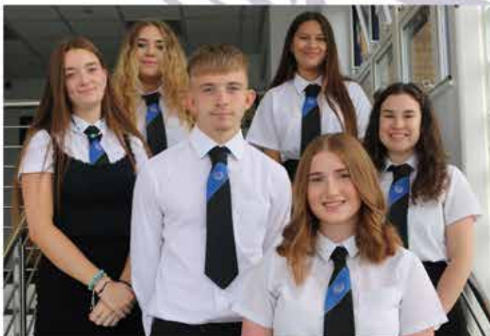
SCOTT House Captains