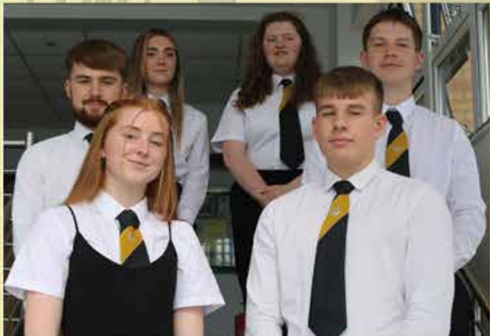
CARNE House Captains