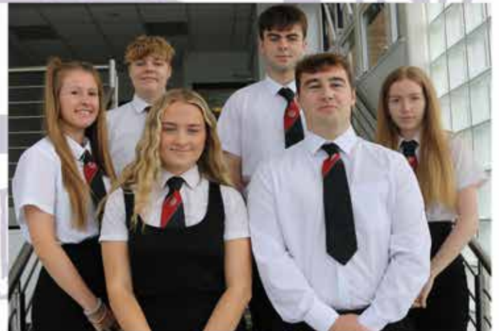
MASEFIELD House Captains