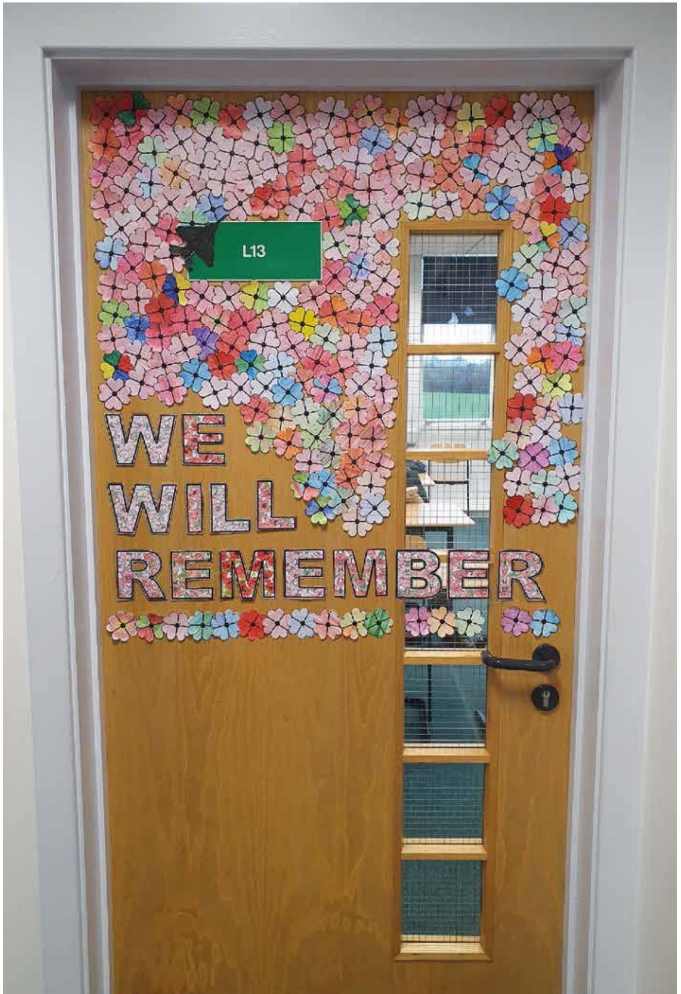
Winning 'Best Door Competition' - 8CC