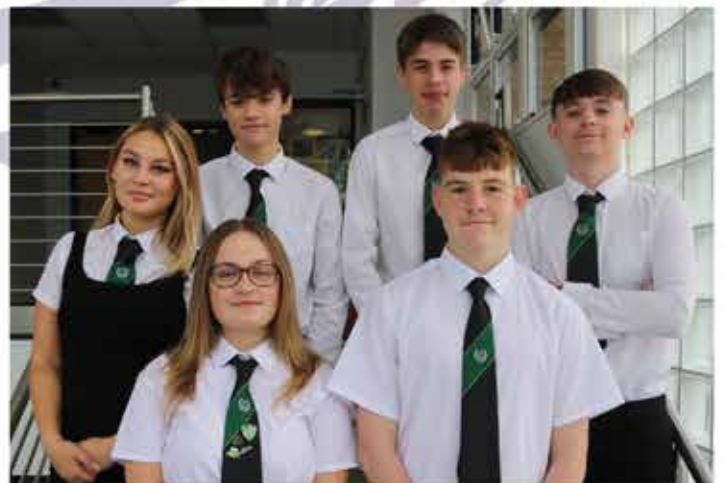
WHITTLE House Captains