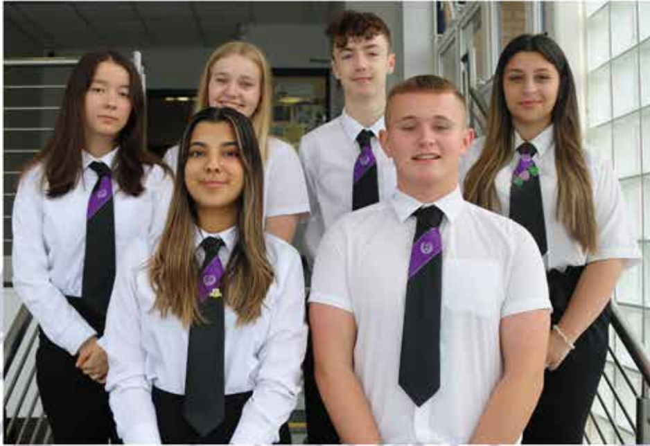
Head Student Team